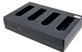
4 Slots Battery Charger